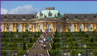
Schloss Sanssouci in Potsdam

Berlin-Brandenburg offers specific funding programmes for innovations, investments and the training of workers. Funding is provided by the European Union, the Federal Government and the states of Berlin and Brandenburg.