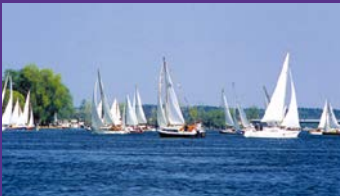
Excellent leisure possibilities in the region

The region offers a unique combination of the international flair of the Berlin metropolis and the fascinating nature and historical sights of Brandenburg. A singular club scene, renowned large events, more than 170 museums, 150 theatres as well as some 500 castles, churches and parks all attract visitors to the region. There are no limits to the sporting and leisure activities, among them golf, horse riding, water sports and flying.