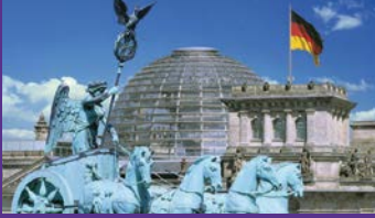
Quadriga in front of the Reichstag dome